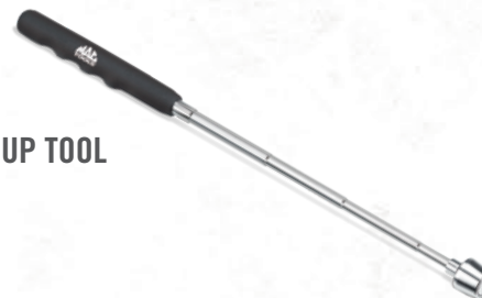
MP5A TELESCOPIC FLEX MAGNETIC PICK-UP TOOL