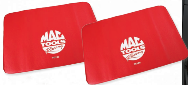
FC100 2 PACK CLING-ON FENDER COVER