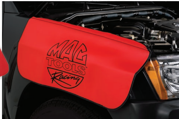
FCM5435B MAGNETIC FENDER COVER