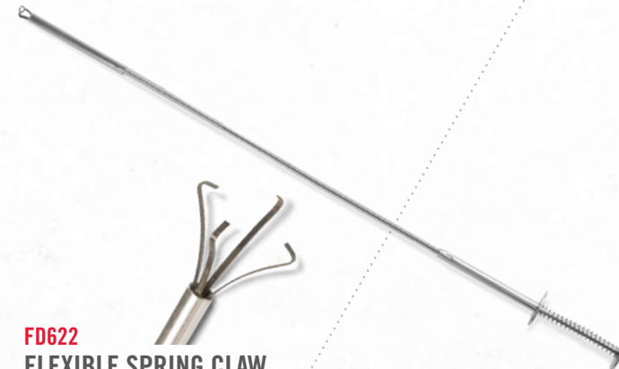
FD622 FLEXIBLE SPRING CLAW