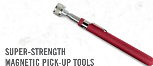
SUPER-STRENGTH MAGNETIC PICK-UP TOOLS