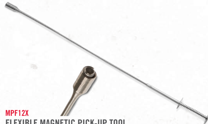
MPF12X FLEXIBLE MAGNETIC PICK-UP TOOL