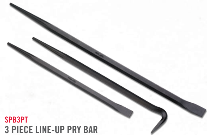
SPB3PT 3 PIECE LINE-UP PRY BAR SET IN PLASTIC TRAY