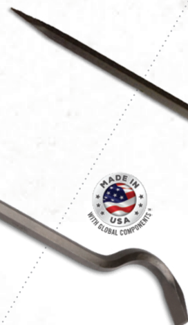
DB18 18" DIE SETTING BAR