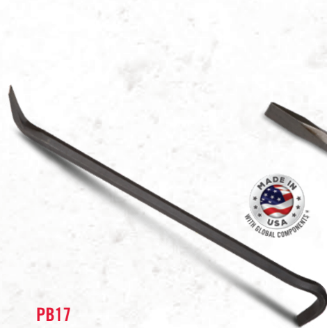
PB17 17" MODIFIED ROLLING HEAD PRY BAR