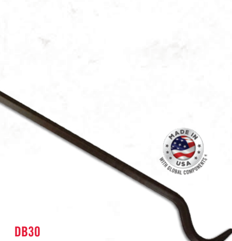
DB30 30" DIE SETTING BAR