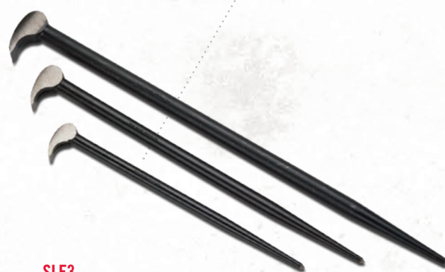
SLF3 3 PIECE LADY FOOT LINE-UP BAR SET IN PLASTIC TRAY